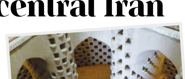
Meybod Pigeon Tower wikipedia.org